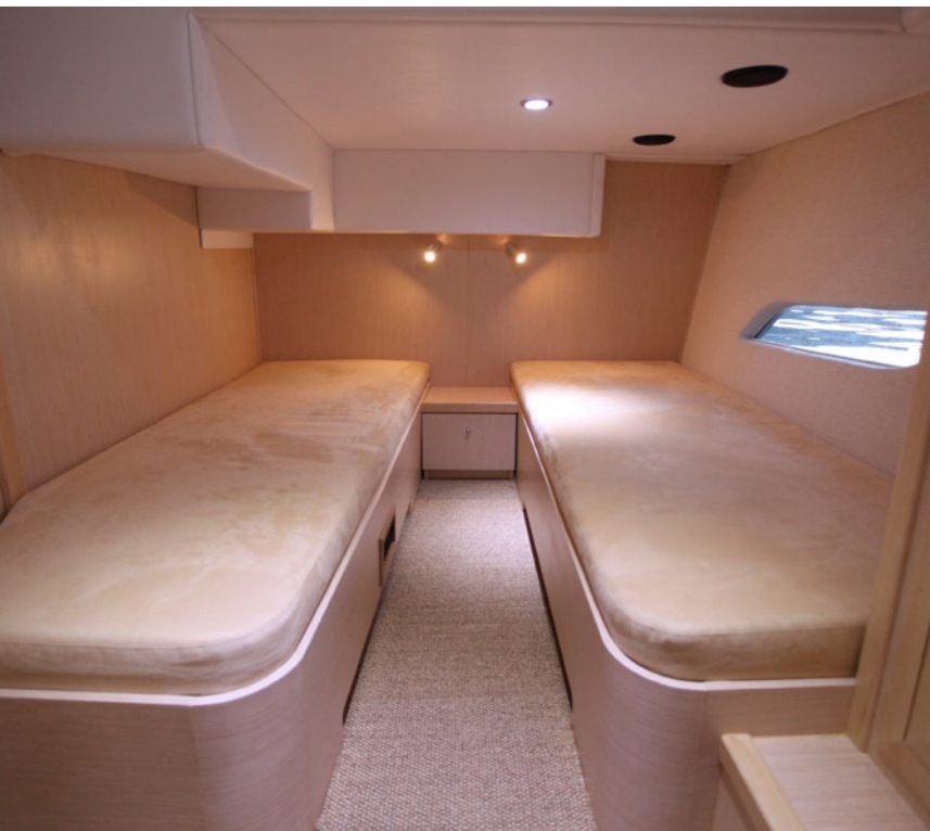
The owners cabin is actually admiral's - with windows on both sides, so that you can always see the sea... Left: a small cabin with two separated beds - for guests or children - is set towards the stern

spends a lot of time at sea. Practicality and functionality of all fittings and frames has been brought to perfection, each, even the smallest particularity has been carefully developed. As we started the engines we found out that the sea loves Monachus: the manoeuvre in the narrow marina basin, with good positioning of the engines and the bow thrust, was a piece of cake. The views from the cockpit are excellent - Monachus can with no problems, be operated by one person only, so one does not depend on a crew. The praised characteristics of the hull, checked in practice, have been confirmed already by the fact that at 1,000 rpm and the speed of 8 knots both engines consume only 11 litres of diesel per hour, while at the speed of 12 knots the fuel consumption has risen to modest 29 l/h. The pleasant cruise speed of 19 knots, with an exceptionally quiet engine-work and a moderate fuel consumption - beginning then to depend on the conditions at sea, wind, sea-currents etc. - is the main feature of the Monachus, one which many renowned leisure boat manufacturers would like to share. It is interesting how Monachus, thanks to the specificities of its hull, can operate as a displacement boat, semi-displacement boat, or as a speedboat, leaving behind itself always an identical wake, avoiding the turbu-